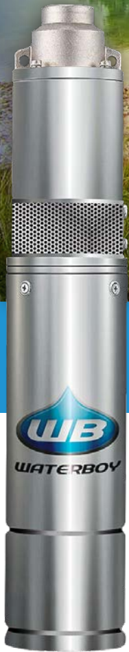
4HRSS-H pump, motor, controller