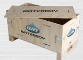
Shipping Dimensions 1x Crate 290 x 55 x 65cm @ 230kg 1x pallet 170 x 115 x 43cm @ 170kg