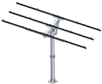
Heavy Duty Cyclone Rated Pole Mount Frame