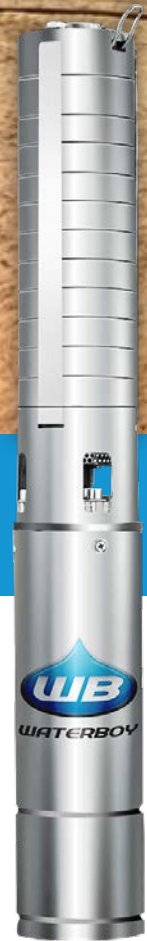
4CS57-8 pump, motor, controller

Each Waterboy solar pump system includes: