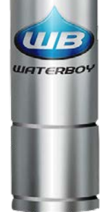
4CSS7-8 pump, motor, controller