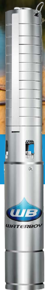
4CSS5-12 pump, motor, controller

Each Waterboy solar pump system includes: