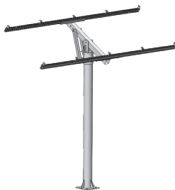
Heavy Duty Cyclone Rated Pole Mount Frame