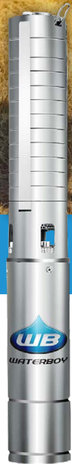
4CSS4-8 pump, motor, controller

Each Waterboy solar pump system includes: