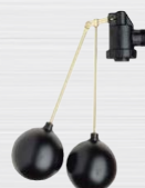
Double acting float valve For use with Pressure Switch - $220+GST