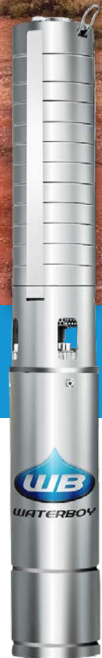
4CSS12-6 pump, motor, controller

Each Waterboy solar pump system includes: