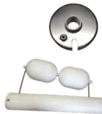
Bore Cap or Dam Float