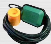
Tank full switch inc 20m cable $110+GST