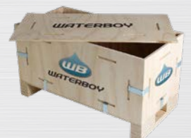
Shipping Dimensions 1x Crate 290 x 55 x 65cm @ 230kg 1x pallet 170 x 115 x 43cm @ 170kg