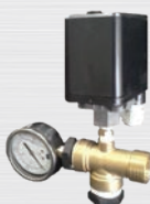
Pressure Switch 12 bar inc gauge & fittings $250+GST