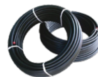
40m of Power Cable low water probe & safety cabling