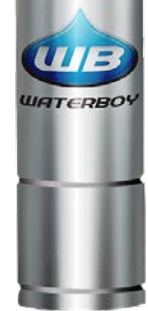
4CSS12-6 pump, motor, controller

Each Waterboy solar pump system includes: